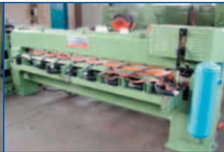
Clipper with Feeding and Outfeeding